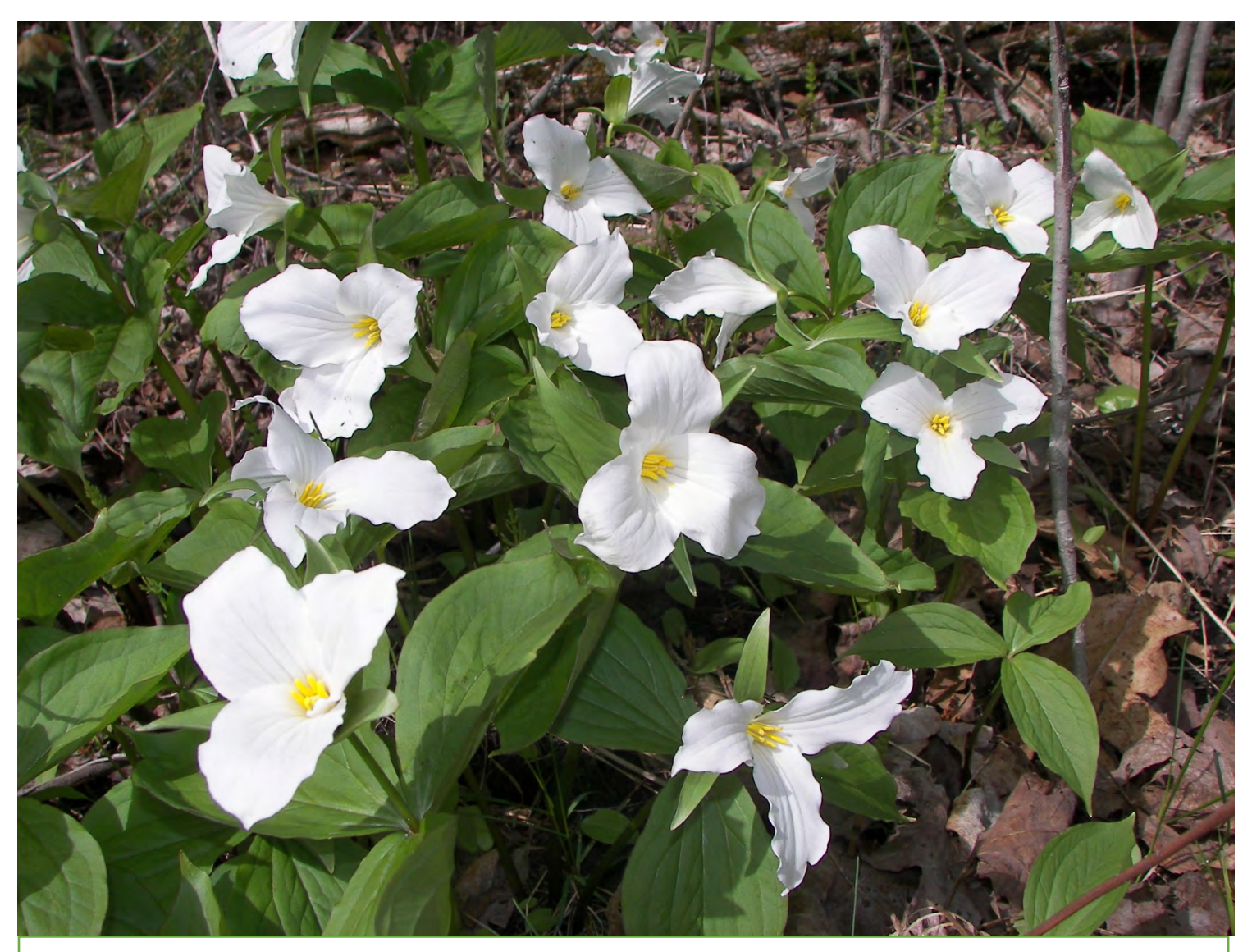
In the nearby forest, I saw these pretty white flowers. Do you know what these are called? Trilliums! What else can you see on the forest floor?