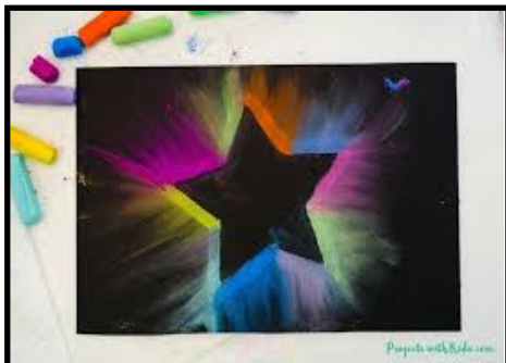
Negative chalk drawing; by taping down a shape and chalking over the shape, creating an aura when you lift the shape.

There was a time that chalk was just for chalkboards and sidewalks. Now inexpensive chalk and chalk paints are available, and you can use them creatively in many different art endeavours. The following ideas will help you use chalk in ways you may not have considered before.