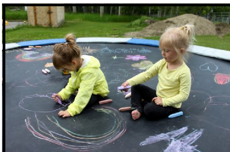
In warmer weather the surface of your trampoline makes a great area to “chalk it up”. Just wash off when finished and you’re ready to start again.