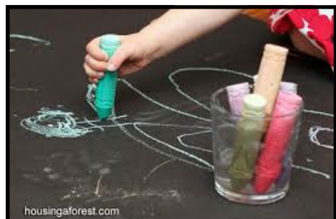
Wet chalk will give your pictures bolder colours and may be easier for little hands to make a mark.