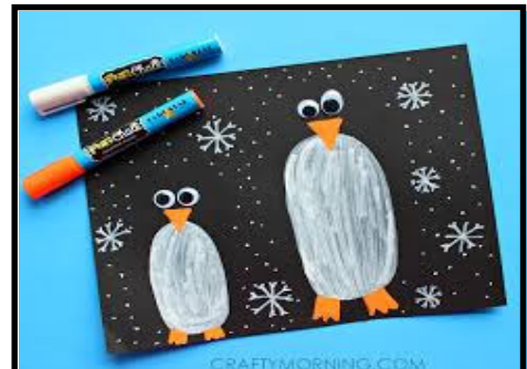
Penguin pictures using chalk paints. Chalk paints have bolder colours and show up well on black paper.